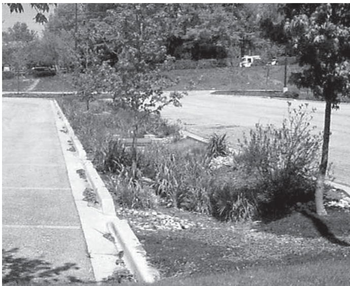
Figure 3. Photo of parking lot with established landscape islands for infiltration of runoff.

be shade tolerant and, if winter salting is the norm, salt tolerant. Shrubs and perennials must be attractive at close range; weedy growth or sprawling habit can make the landscape appear unkempt. Evergreen leaves and showy flowers are a bonus. Maintenance for bioretention landscape islands is not much different from that required for a standard landscape island: annual testing of soil pH, mulching, inspection of plants for pests, pruning for shape and vigor, and regular litter removal. The specification of flood-tolerant woody and herbaceous perennial plants will ensure that any intermittent flooding is a benefit rather than a threat to plant health. Balanced combinations of both